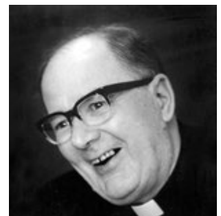
Bernard Lonergan, S.J.