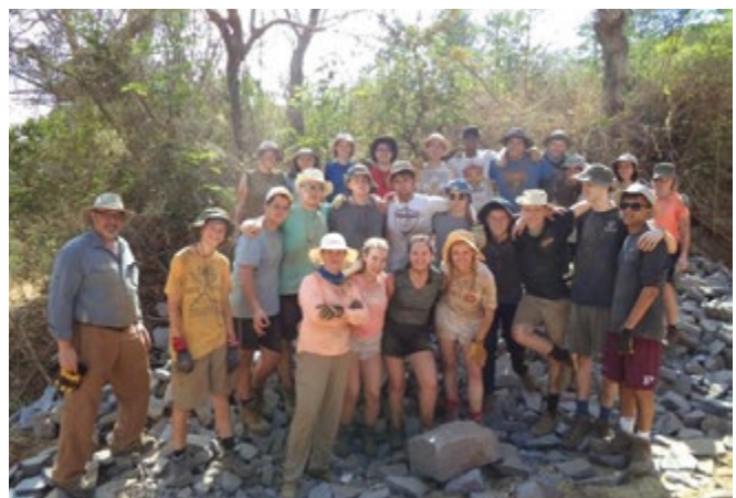
The group after a day of repairing the road to a school

What I can tell people; Stop reading negative articles. Don’t believe anything negative until you see it with your own two eyes. Never judge a book by it’s bad cover. That book might just change your life in ways you don’t quite know how to explain. Don’t trust negativity. Get out and experience. Feel.